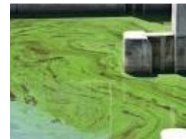
Dolichospermum sp. Bloom