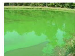
Microcystis sp. bloom